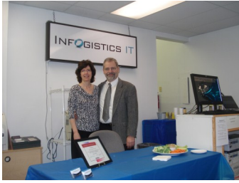
January Business of the Month, Infogistics IT

Nominations for the recognition are reviewed by the Chamber's Membership Committee. The Chamber bases the nomination selection on the following criteria: must be a member in good standing of the Fairport Perinton Chamber of Commerce, the business must have been established and operated continuously for at least 12 months, nominee must have donated resources (time, talent, money, etc.) to the community via projects, organizations, volunteering, clubs, church, etc. and the business has a reputation for honesty and integrity in their practice. Winners of the Business of the Month will receive recognition at a Chamber breakfast, will receive publicity in the Chamber's newsletter, and will receive a sign/banner to be placed at the business