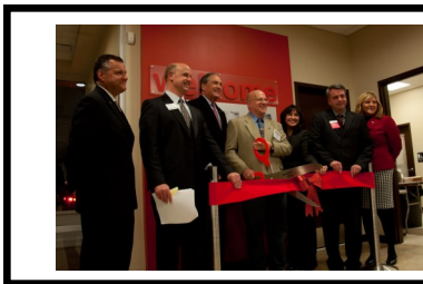
Ribbon Cutting at the newly remodeled Key Bank Perinton Branch

Winning Strategies for Small Business Marketing January 14, 2014 Maplewood Estates 55 Ayrault Road, Fairport NY REGISTER NOW Free parking at east end near Cottages